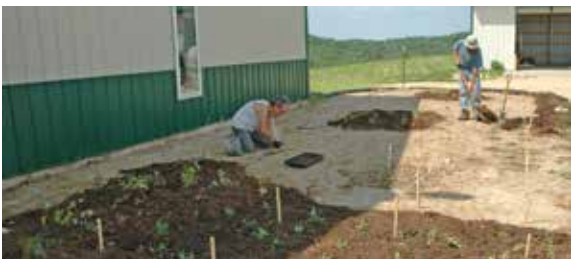
02/20 • 12K