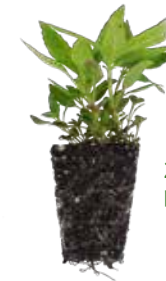
2.5" x 3.5" plant from 3-pack

hole or apply in advance over the entire surface of the site. If adding organic material, only use moderate amounts and mix thoroughly with existing soil. Do not create a pocket of soil around the roots that is markedly different from the surrounding original soil.