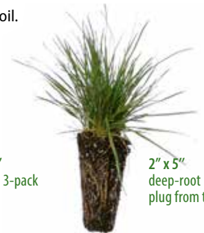
2" x 5" deep-root plug from tray

After the planting holes are prepared, remove plants from the pre-moistened container. DO NOT pull on top growth before firmly squeezing the pot sides and pushing up through the bottom holes. Once the mass is loose, continue to squeeze sides and gently wiggle the plant to release the root ball intact. Hold the plant so that the top of the soil around the plant is at the same level as the surrounding soil. Firm in place, forming a slight dish to hold water. Watering gently but deeply will settle the soil around the roots and allow new, and deeper root formation. We suggest marking the location of any new plant with a sturdy tag that will stay in place through the establishment phase. This will help to ensure that the plant receives the early care that it might require. It can also ensure that a desirable plant is not mistaken for a weed.