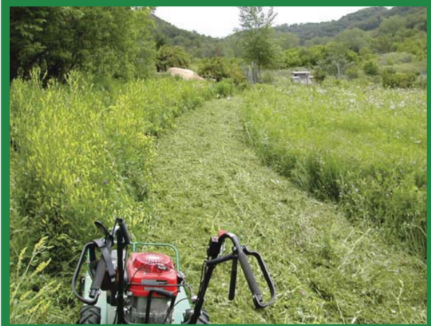
Mowing Yellow Sweet Clover in full flower when it is too thick to hand-weed.

Mow each time weed growth reaches 8-10 inches. Cut everything