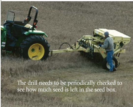
The drill needs to be periodically checked to see how much seed is left in the seed box.