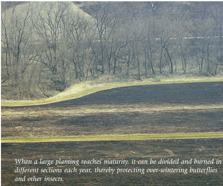
When a large planting reaches maturity, it can be divided and burned in different sections each year, thereby protecting over-wintering butterflies and other insects.

Most native plantings, after two or three growing seasons, need to be burned annually for the next five or more years to become well established. Burning yields better growth and more flowers. Mature prairies with no weed problems may need burning only once every three years.