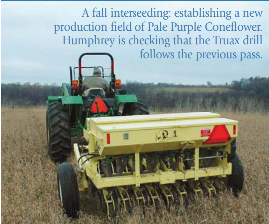
A fall interseeding: establishing a new production field of Pale Purple Coneflower. Humphrey is checking that the Truax drill follows the previous pass.